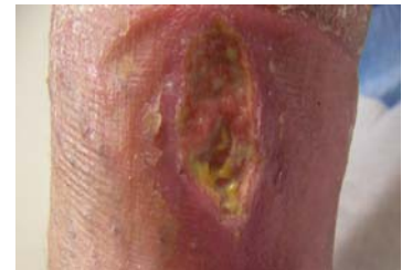
Chronic Wound: Note the yellow fibrous tissue

In subsequent articles, I will discuss the different methods of wound healing including surgical debridement, wound dressings, external supportive systems and negative pressure wound treatments (Vacuum Assisted Closure).